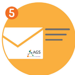
5 Report Delivered in 2-3 Weeks