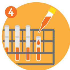
4 Tested at AGS Laboratory