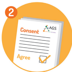
2 Complete Simple Form