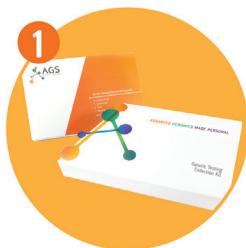
1 Acquire AGS Collection Kit

To gather your unique DNA, the simple and painless test requires only that a cotton swab be rubbed on the inside of your cheek. The sample will be delivered and analyzed in our state-of-the-art laboratory and you will receive your report in approximately two weeks.