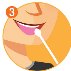
3 Collect Cheek Swab